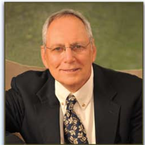
NATUROPATHIC PHYSICIAN INTEGRATIVE MEDICINE